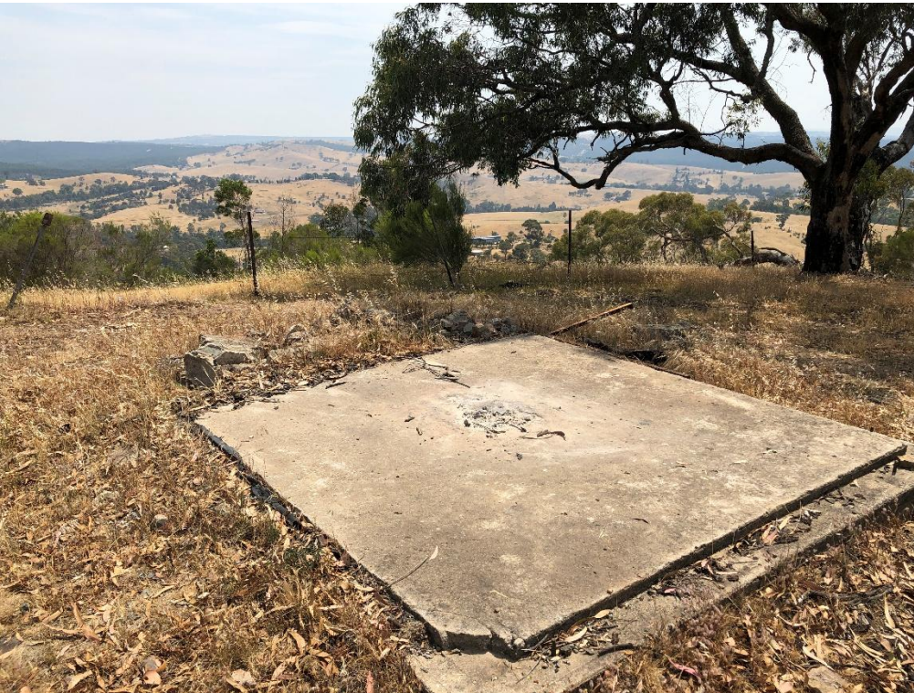
Photo taken of the concrete slab base looking south towards Pretty Sally