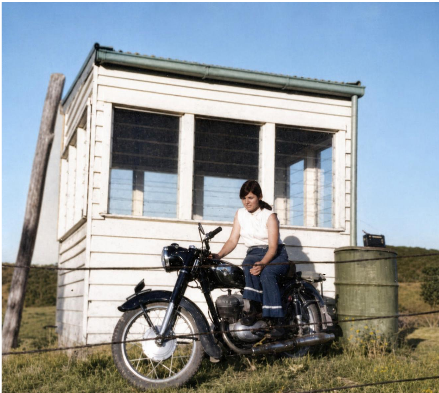
Jack Brewer's photo (Colourised) taken in 1966 of the Spur Lookout Station. Photo is taken from the south on the other side of the wire fence standing on private property looking north.

Jack Brewer rode his DKW 250cc 2/stroke bike with his partner up to the lookout in 1966 and took a photo we have been waiting to see for a long time. The Spur Lookout station.