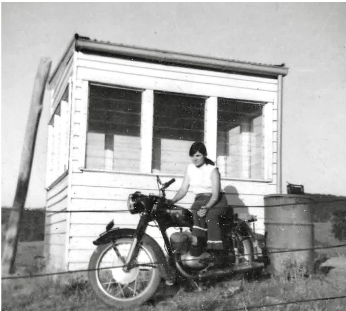
Jack Brewers' original 1966 photo of the Spur Lookout Station