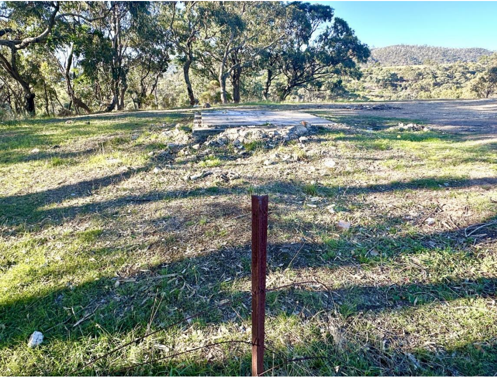
Photo taken 25/4/2026 from the same position as Jack brewer's photo of 1966